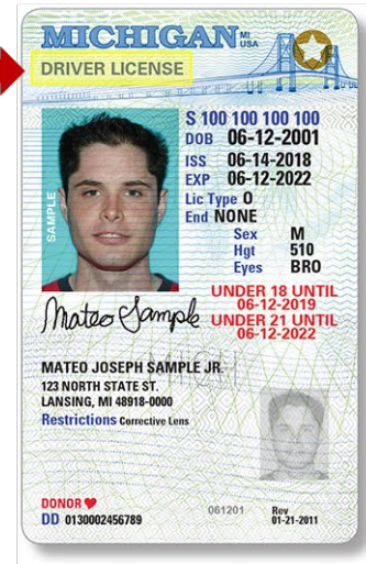
License for GDL 3