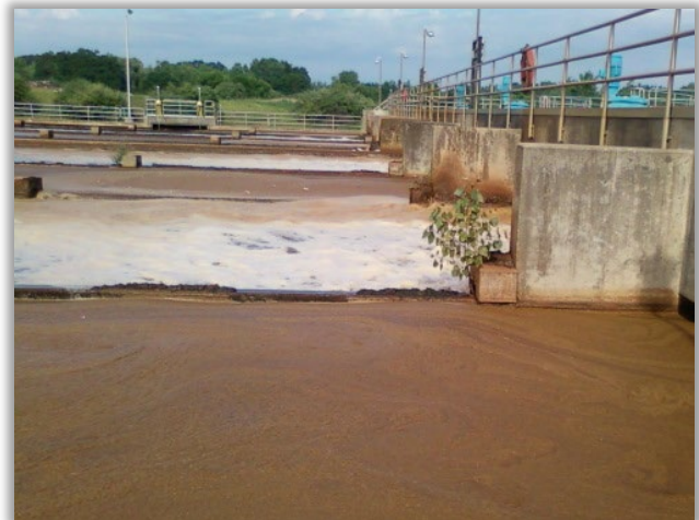
Foam at a treatment plant because of industrial discharge.