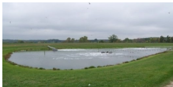
Sanitary Sewage Treatment Lagoon

To apply for coverage, submit the permit application to EGLE along with information that demonstrates conditions required by the general permit. A facility is authorized to discharge to the ground or groundwater once they receive a Certificate of Coverage from EGLE that verifies the discharge is authorized under this rule. The annual permit fee for Rule 2215 authorization is $1,500, except for