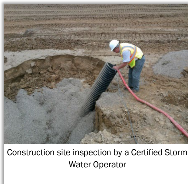
Construction site inspection by a Certified Storm Water Operator

For more information on Permit-by-Rule, including application materials, certified operator exam training materials and exam schedules, or storm water program contact information, contact any EGLE's District Office or go to Michigan.gov/SoilErosion .