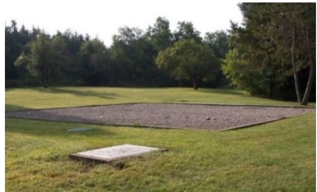
Groundwater Infiltration Bed

To obtain this type of authorization a facility must complete a groundwater discharge authorization application. A facility is authorized to discharge once an adequate and complete application is received by EGLE. As long as the discharger certifies that they meet the individual rule criteria a facility will be authorized to discharge at the time an adequate and complete application is received by EGLE. If the application is complete and meets the requirement of the rule, EGLE will authorize the discharge via a permit. If the application is deficient, EGLE will notify the applicant and any deficiencies must be corrected before the discharge is authorized. The annual fee for this type of authorization is $200.