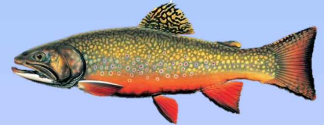
Illustration provided by Joseph Tomelleri©