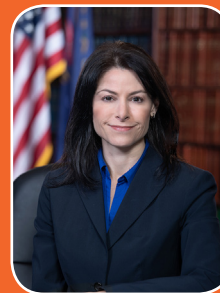
Dana Nessel Attorney General

Attorney General Consumer Programs 517-335-0855 agcp@mi.gov